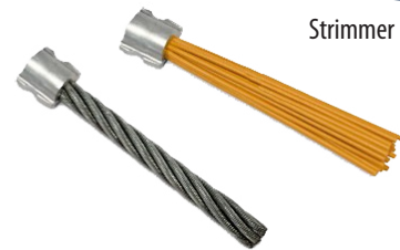
Steel and nylon replacement brushes