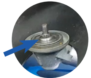
Strimmer Head Connection