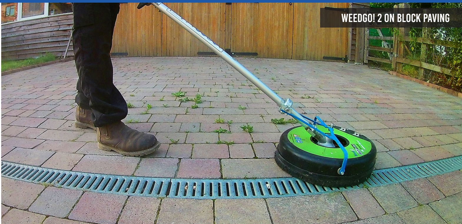
WEEDGO! 2 ON BLOCK PAVING